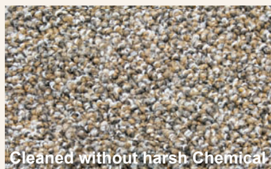
Cleaned without harsh Chemical